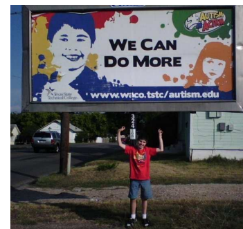
The Walk is a collaboration between the Arc of McLennan County, the Heart of Texas Autism Network, and Baylor University’s School of Educational Psychology.